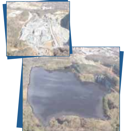
Bellwood Quarry After